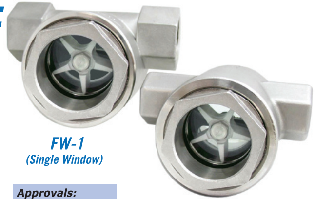
FW-1 (Single Window)

Service: For gases and liquid Wetted Parts Material: Window- Tempered glass; Body- SS316, SS304, SS316L; Gasket- Teflon; Impeller- (1) ABS plastic, (2) PVDF, (3) PPS+40% glass fiber Temperature Limit: For impeller- (1) ABS plastic: 70°C (White), (2) PVDF: 100°C (Red or White), (3) PPS+40% glass fiber: 200°C (Dark Brown) Pressure Limit: FW-1: 150 psig (10.34 bar) FW-2: 125 psig (8.62 bar) FW-3: Available for 15, 25 and 40 kg/cm 2 @25°C Water Connection: Threaded and Flange available Size: (FW-1 & FW-2): 1/4", 3/8", 1/2", 3/4", 1", 1 1/4", 1 1/2", 2" Thread NPT or PF female; and Flange type available (FW-3): 2" to 8" Flange type only