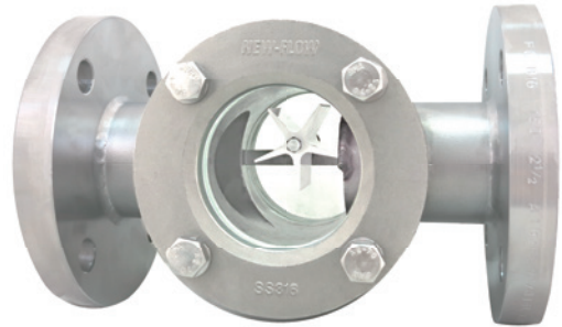
FW-3 (Flange, Double Window)